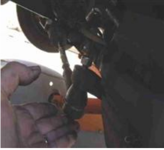
Reconnect the tie rod end and retighten the ball joint screws.