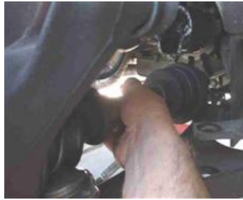
Now carefully pull the slider bearing out of the tulip. Later you will clean the tulip up, but for now you will have your hands full of the axle. Cover the tulip with a plastic bag to keep dirt out.