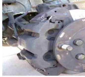
Replace the caliper by doing the removal instructions in reverse. Be sure to get the small clips in place.