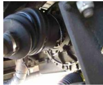
Here is the picture of the old outer boot.