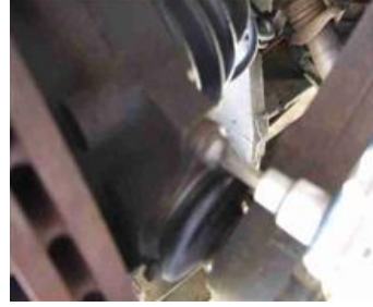
This photo is a bit out of focus, but you get the idea. Use the 10mm Torx driver to remove the two bolts that hold the bottom ball joint to the wheel hub. I replace the torx head bolts with a standard 8mm X1.25 X 20mm hex bolt, .