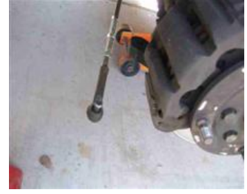
Remove the tierod end from the hub.