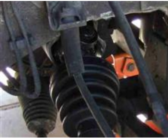
Mark the orientation of the axle to the tulip. Pull the boot back to expose the bearings. At this time verify that the splines are loose on the wheel end. if they were not, things will get ugly real fast.