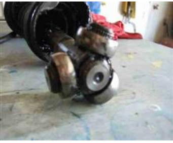
Exposed slider bearing with circlip at end. Clean the excess grease off, but don't go overboard. Unless there is obvious hot spot discoloration, or visual damage, you don't want to strip all the grease off of these