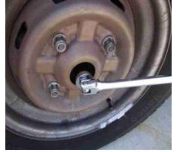
Put the tire back on, take the rig off the jackstands, and torque the 30mm nut back on to approximately 175ft/lbs.

At this point you are done with the one side. Go have a beer then start on the other side!