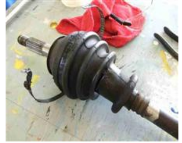
Cut the bands off the outer boot.