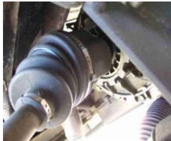
This is a picture of the inner slider joint "tulip" with the boot banded on. Get a set of side cutters and clip the large outer band.