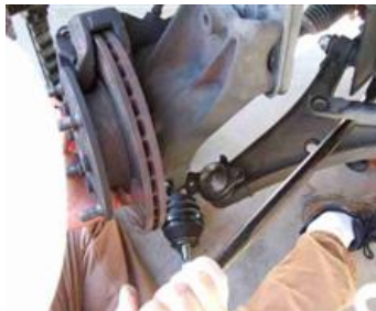
Break the lower control arm loose from the wheel hub. You might have to use a pry bar to do this. If so clean it up so save yourself some grief on reassembly. Note that this picture was taken after the axle was removed, but it still is the same action.