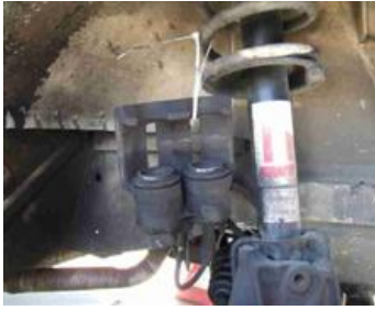
Get a cheap tywrap and hang the caliper up. Saves replacing the brake lines.

probably a good time to inspect and replace if necessary.