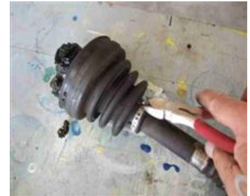
Cut the small band from the inner boot and slide the boot back. note the ridges on the axle. When reinstalling the boot these will be important to remember.