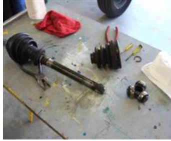
Here is the axle with the slider bearing and inner boot removed.