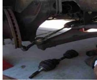
Axle out of tulip and hub. Beer break.....