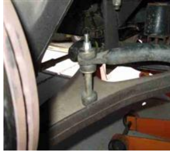
Reconnect the torsion bar.