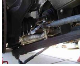
Disconnect the torsion arm bolt. If the rubber is worn or damaged, go buy a set of 1" polyurethane replacements from any parts dealer. This is the time to do it.