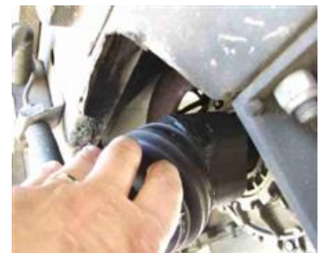
Pull the boot off of the tulip. If it is cooked on, this may take a bit of effort. Also, it is full of grease. Get a roll of cheap paper towels, you will need them!