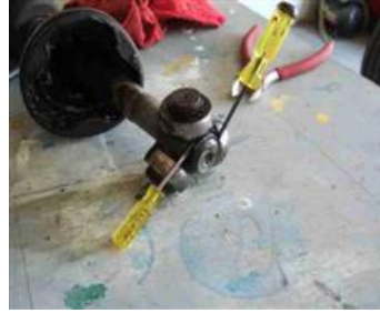
Carefully work the circlip off. Be careful, as it will fly away and you will be looking for it for hours! Mark the orientation of the slider bearing on the axle for reassembly purposes.